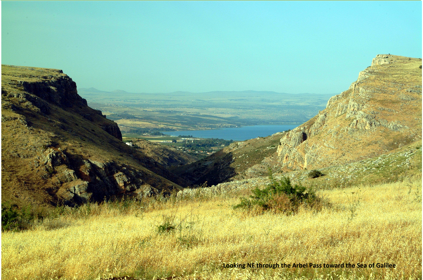
Looking NE through the Arbel Pass toward the Sea of Galilee