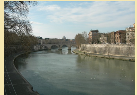
The Tiber River in Rome