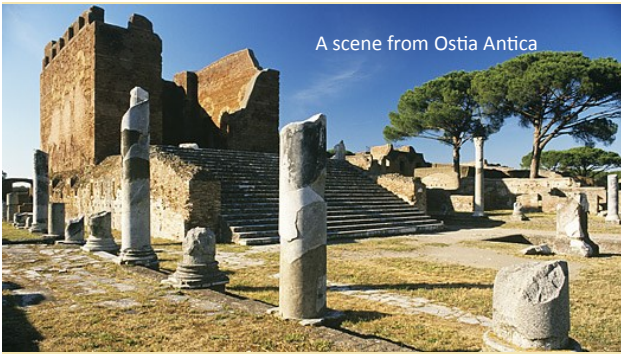
A scene from Ostia Antica

Day One: Depart the USA for Italy. Overnight: In flight.