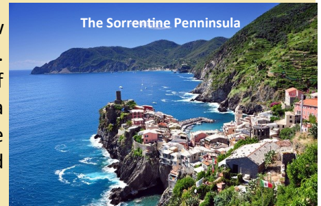
The Sorrentine Peninsula

Day Three: Paul in the World that was Rome. Theme: To be Paul – how God used a man with a Hebrew heart, a Greek tongue and Roman mind. Departing Ostia Lido, we will drive along the coast to Sperlonga, the site of an ancient villa of Emperor Tiberius. On to the excavations at Minturno, a Roman town known to Paul and his companions. We will travel on to the city of Pozzuoli (ancient Puteoli), the harbor city where Paul first stepped onto the Italian Peninsula (Acts 28:13). Overnight: Pozzuoli (B,D).