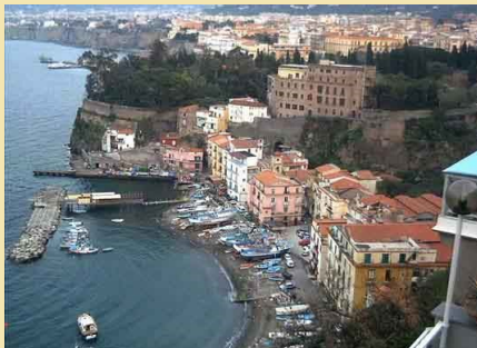
The harbor at modern Sorrento

Day Ten: Morning transfer to the airport for your flight back to the USA ... or continue with your own extension.