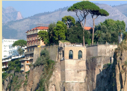
The cliffs overlooking the bay of Naples