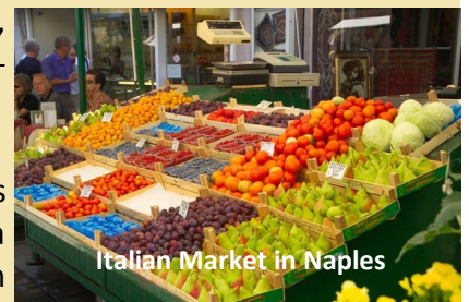
Italian Market in Naples

Day Six: Playboys, Pagans and Philosophers. Theme: Today we will touch Paul's life by examining artifacts taken from homes at his time, as well as visiting villas of people who were his contemporaries! At impressive sites we will discuss the popular philosophers of the time and become familiar with some of the more attractive pagan rites of his contemporary culture. Sites include: Maritime Villas, Oplontis (Villa Poppea), Abbey at Montecassino. Overnight: Mansio Foro Appio. (B,D).