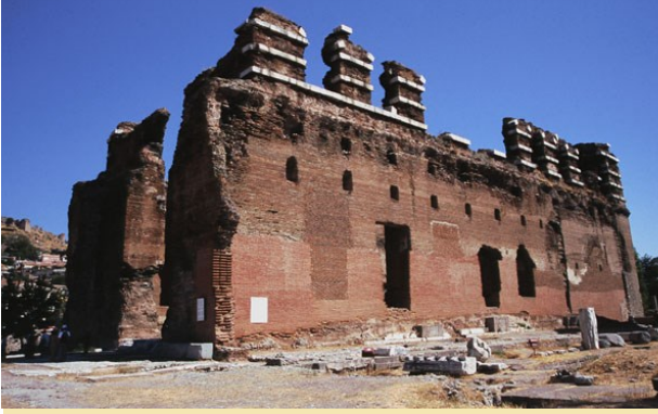
Red Basilica at Pergamum

vened. The Basilica of St. John. Visit the Museum of Ephesus for an up-close look at artifacts from the ancient city. Dinner and overnight in Kusadasi (B,D)